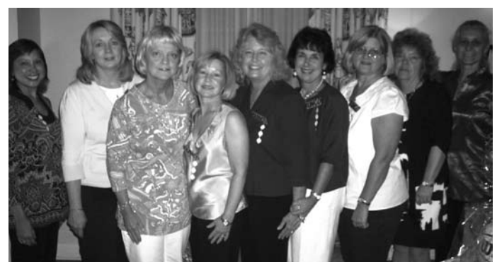
Members of the St. Francis Hospital Domestic Violence Committee , who hosted their annual Bunco Night on September 10 and raised $8,323 for the YWCA Resolve Program.