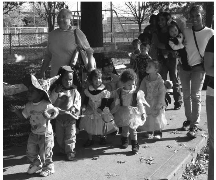
Children, teachers, and even a few parents enjoyed a Halloween costume parade at the YWCA Child Enrichment Center on October 30.