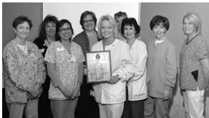
Members of the St. Francis Hospital Domestic Violence Committee accept the 3rd Annual Hope Award from the YWCA Resolve Program for their tireless dedication to improving the lives of domestic violence victims and their children through service, support and awareness.