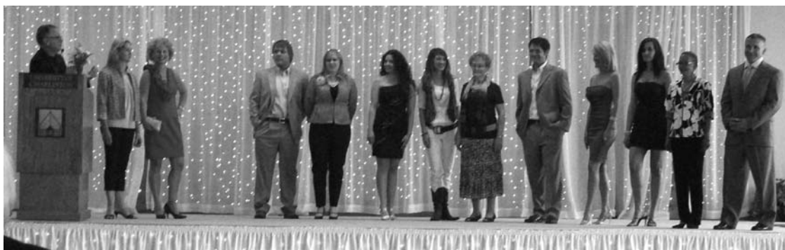
Volunteers modeled fashions from Cache, Chico's and Kelley's Mens Shop at the Soroptimist International Fashion Show to benefit YWCA Sojourner's last month. Special thanks also to the numerous individuals and companies that donated door prizes, auction baskets and flowers.