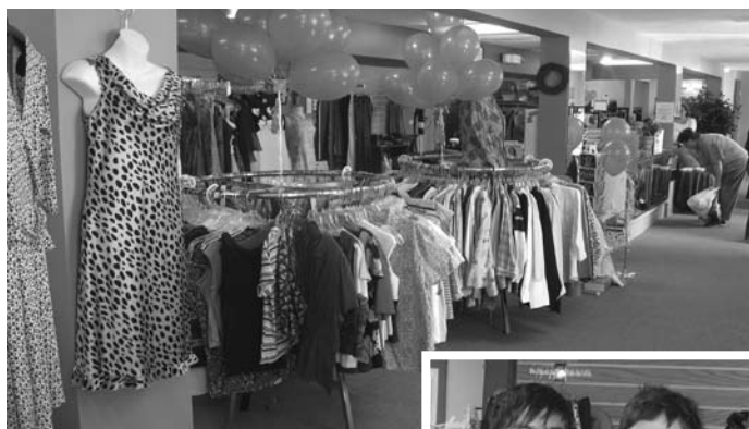
Above: YWCA Past & Present celebrated the shop's extreme makeover with an open house on April 10.